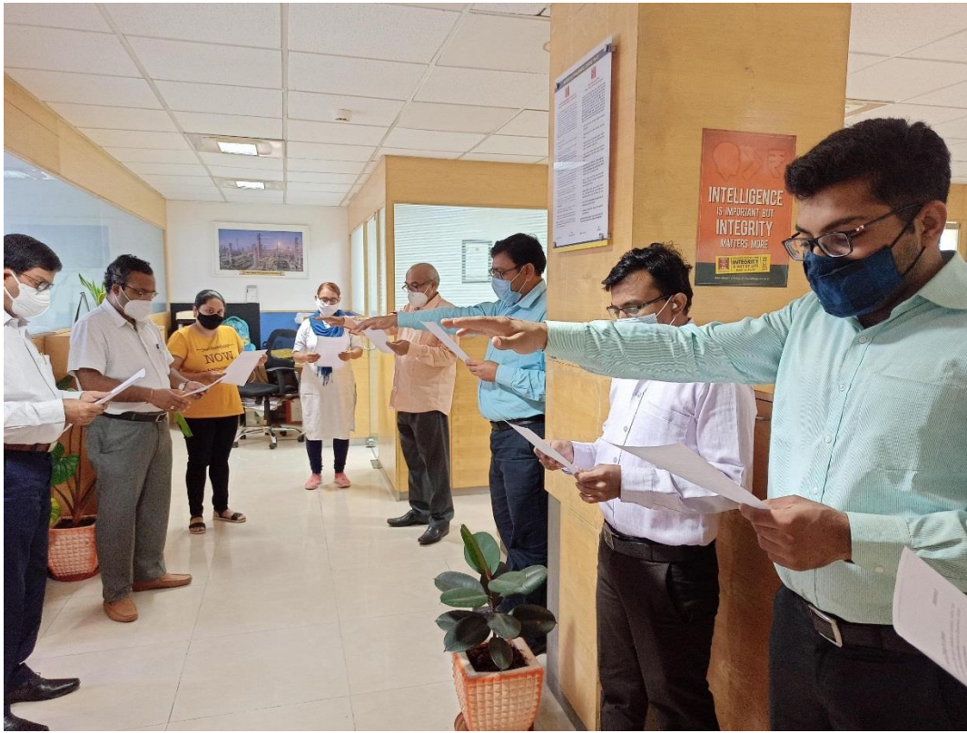
Employees taking pledge of integrity at the Corporate Office