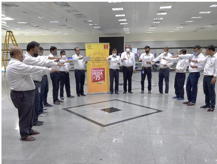
Employees taking pledge of integrity at the Dahej plant

During all the VAW activities, COVID appropriate behavior was followed and all the prescribed precautionary measures were followed.