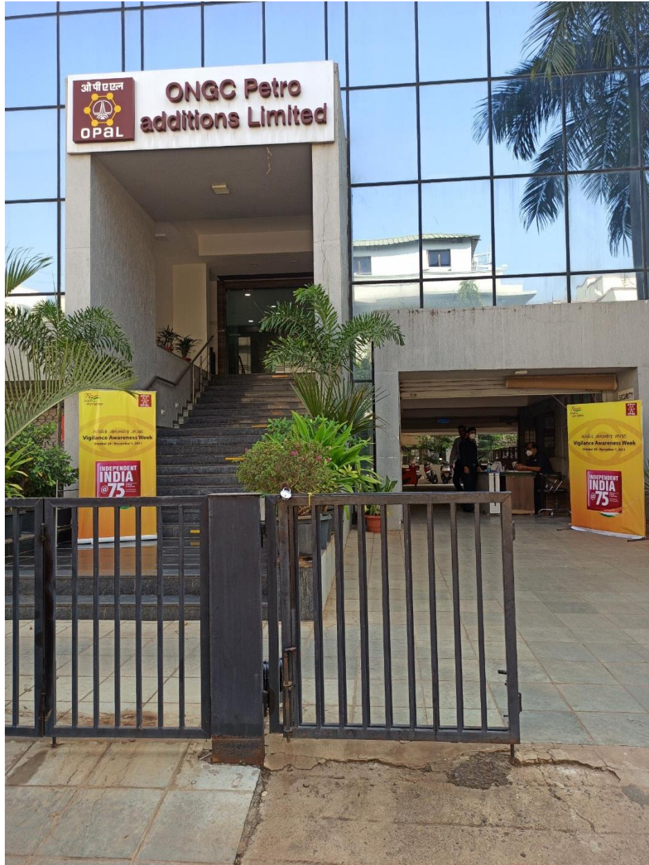
VAW 2021 standees displayed at the Corporate Office